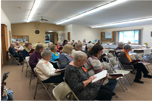
Serving Zion with Altar Flowers, Bulletin, Bread & Wine, & Fellowship